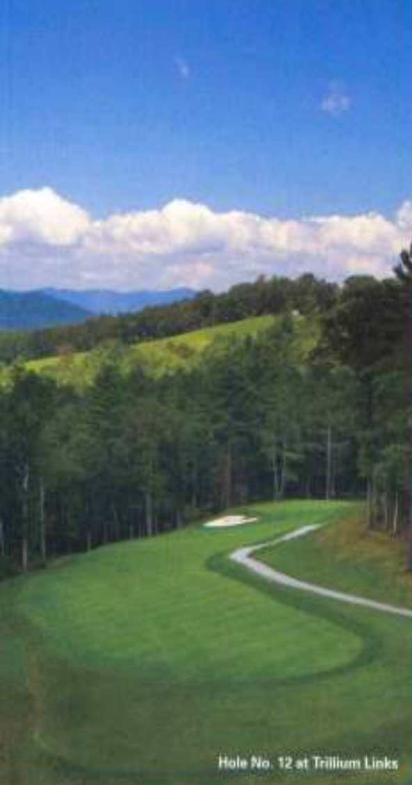
Hole No. 12 at Trillium Links