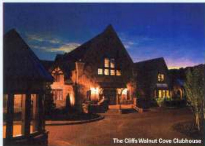
The Cliffs Walnut Cove Clubhouse

and Country Club are within minutes of each other. All feature multimillion-dollar homes and all have golf courses ranked among the top 10 in the entire state by the North Carolina Golf Panel.