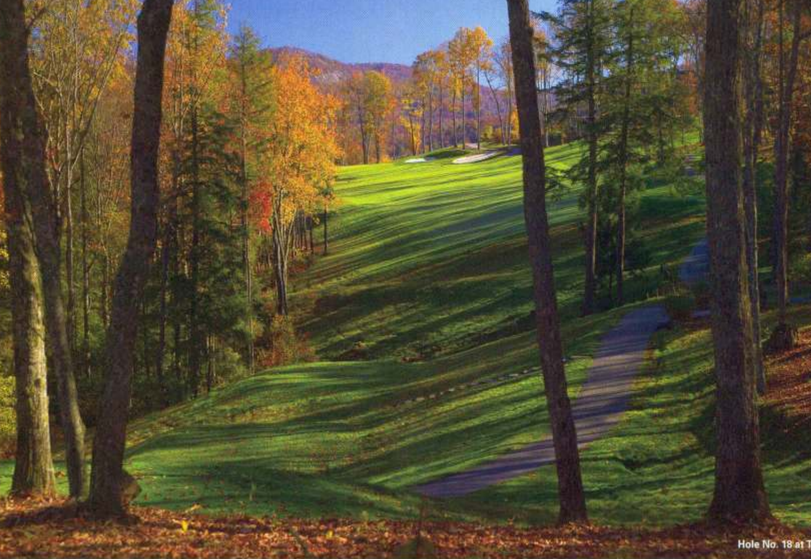
Hole No. 18 at T

this must factor in on the 29 percent increase in the total dollars of home sales from 2004 to 2005.