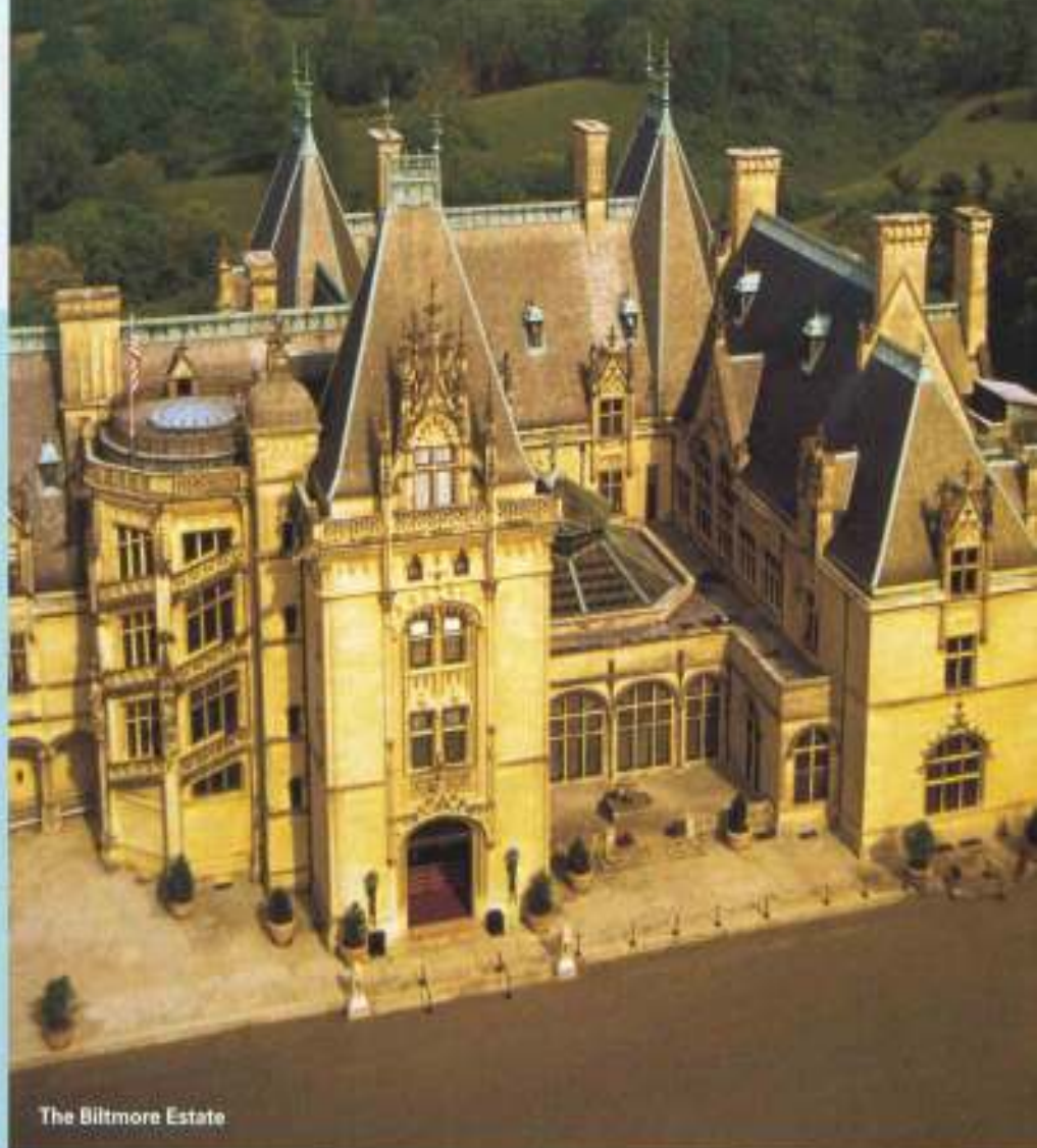
The Biltmore Estate