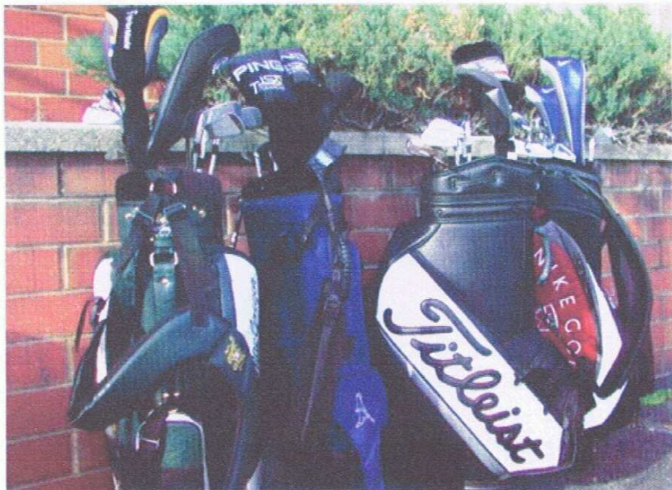
What thief wouldn't be tempted by unattended bags boasting name-brand clubs and bulging with expensive boy-toys.