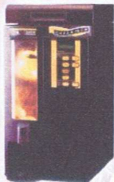
The Caffé Mio

We provide exceptional coffee, brewing equipment and service to companies with 10 to 10,000+ employees.