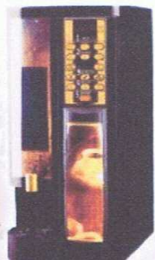
The Caffé Mio