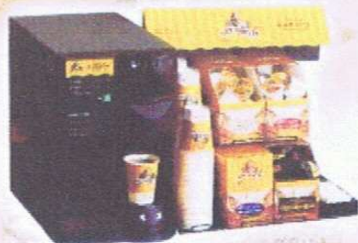
Coffee a la Carte

When filing a claim, Oughton says there is "no dollar limit" on golf clubs in homeowner's policies. "Even if you have a $15,000 set of Yonex clubs stolen, we're going to pay you for it (minus deductible and depreciation). Of course, if you had a $15,000 set of clubs, I would want a little proof." NC